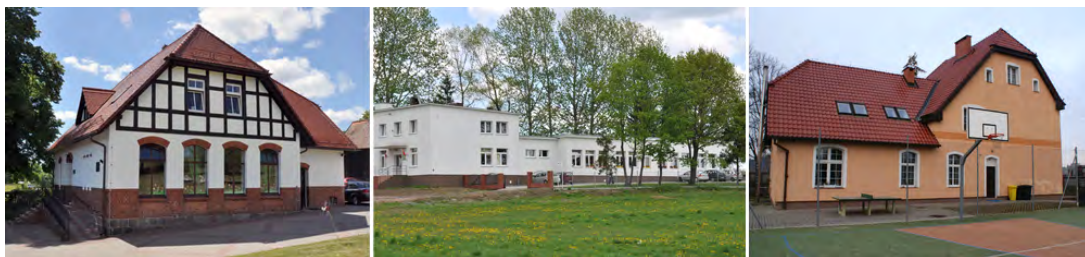
Schools for the disabled in Strzecz, Sikorzyno, and Pierszczewo, Poland.

The International Dr. Svetlana Masgutova Institute of Poland is proud to support these fine schools!